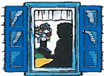
Remember Our Homebound Friends

Remember our friends who are homebound or in a care facility by sending them a card to brighten their day: