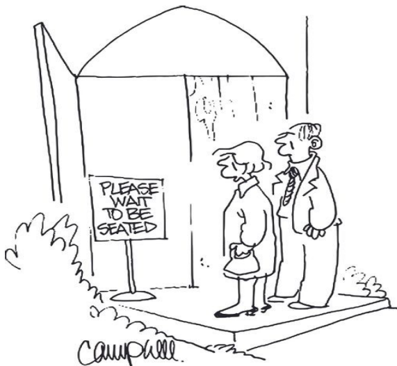
"I understand the new usher is in the restaurant business."

Our Weirsdale Presbyterian ushers are the best!