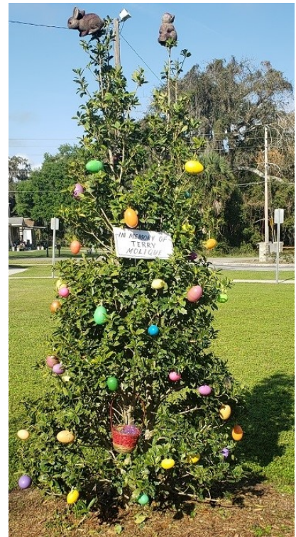
Our holiday tree decorated for Easter. In Memory of Terry Molique.

Only $7.00/meal for a complete home-cooked meal.