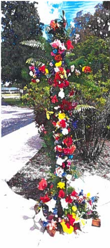
Our Living Cross