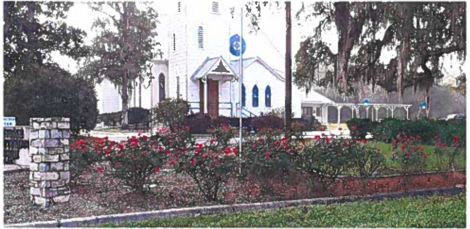
The Roses were in full bloom and glory!